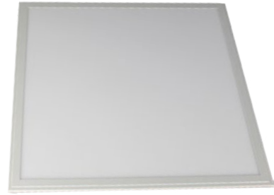
LED Flat Panel