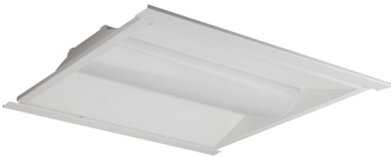
LED Troffer Retrofit Kit-DL 2x2