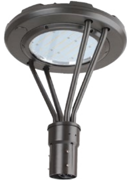
Led Moon Series Post Top