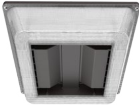
LS Garage Light