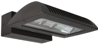
V-Line Wall Pack