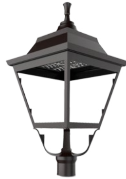
Pavilion Led Post Top