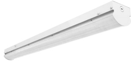
LED STD Strip