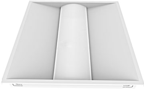
LED Center Basket Troffer