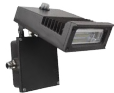
Leopard Series Mini Wall Pack