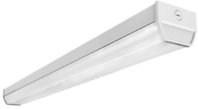
VISION LED Strip Light