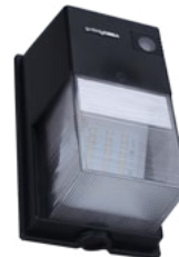
LED Security Light