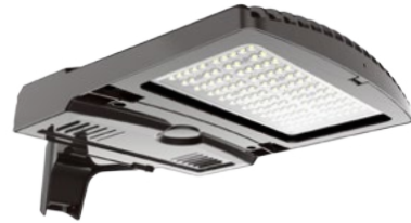
SMT LED Area Light