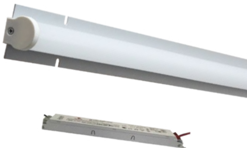
LED Linear Strip Retrofit Kit