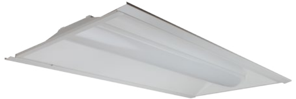
LED Troffer Retrofit Kit-DL 2x4