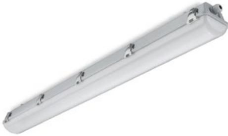
VISION LED Strip Light