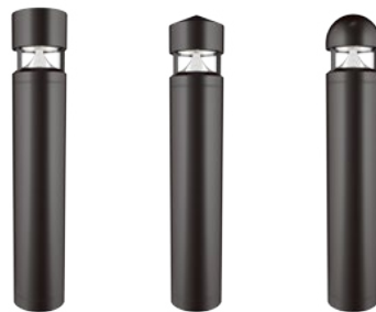
Standard LED Bollards