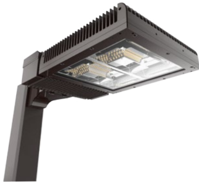
MT LED Area Light 100W 150W 200W